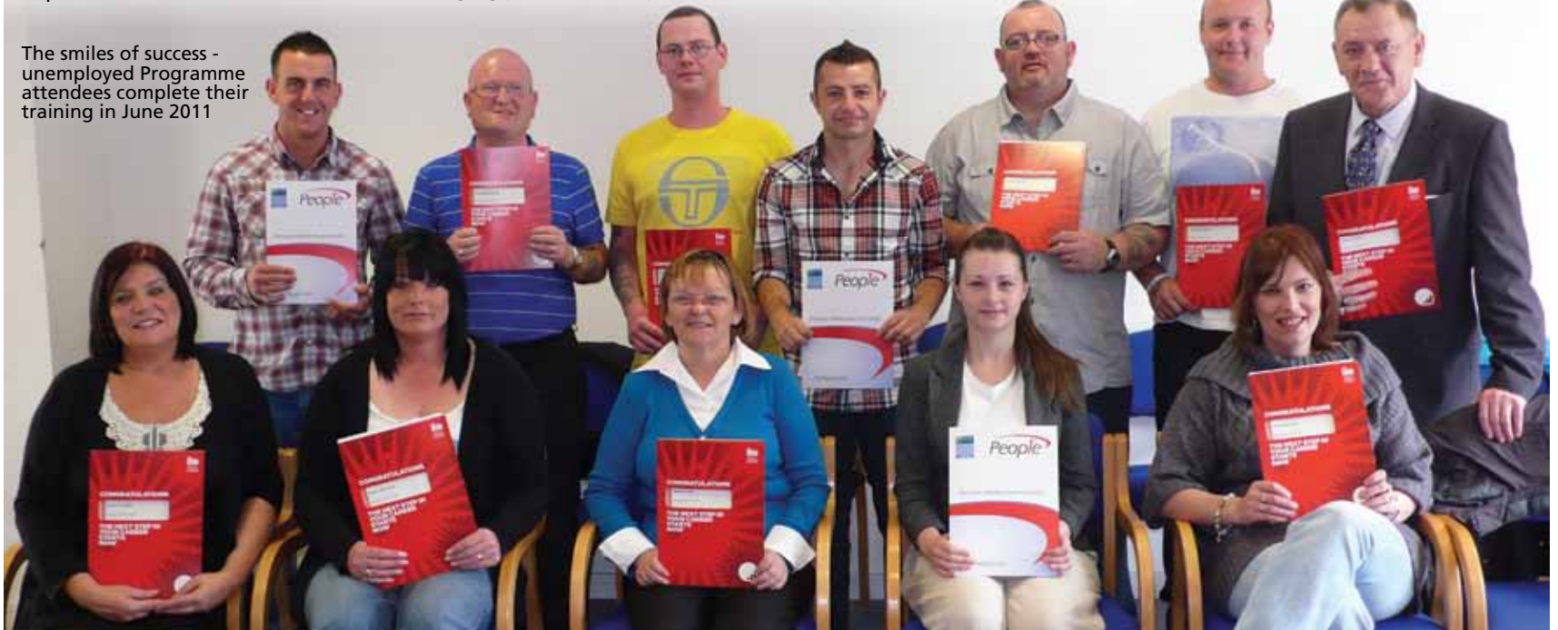
The smiles of success - unemployed Programme attendees complete their training in June 2011

The Construction Cluster have already decided to again borrow the Northstone Supervisor Development Programme in 2012 and deliver it to another group of long term unemployed people in West Belfast and Greater Shankill.