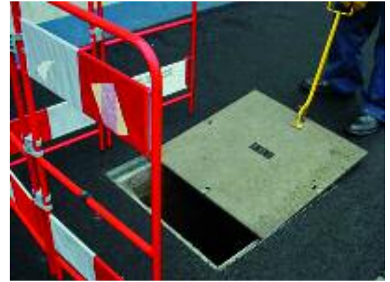
Lifting the lid on another Salmor product

July 2006 saw the arrival of Salmor Industries as the latest addition to the Northstone (NI) Limited. Salmor has its manufacturing operations based at Silverwood Industrial Estate near Lurgan, Co. Armagh, where it employs 75 people. It is a leading supplier of access covers and specialised fabricated steel products to utility markets throughout the UK and Ireland.