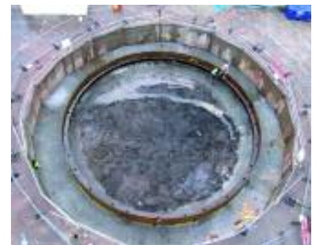
Preparations under way to sink shaft 15 at Duncrue Waste Water Treatment Works

Northlink will carry regular updates on the Belfast Sewers Project in future editions as construction activity gathers pace largely unseen by the wider public as Farrans go underground beneath the heart of the city.