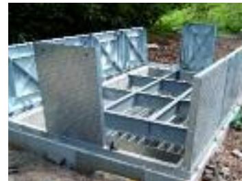
A Salmor ??? for United Utilities