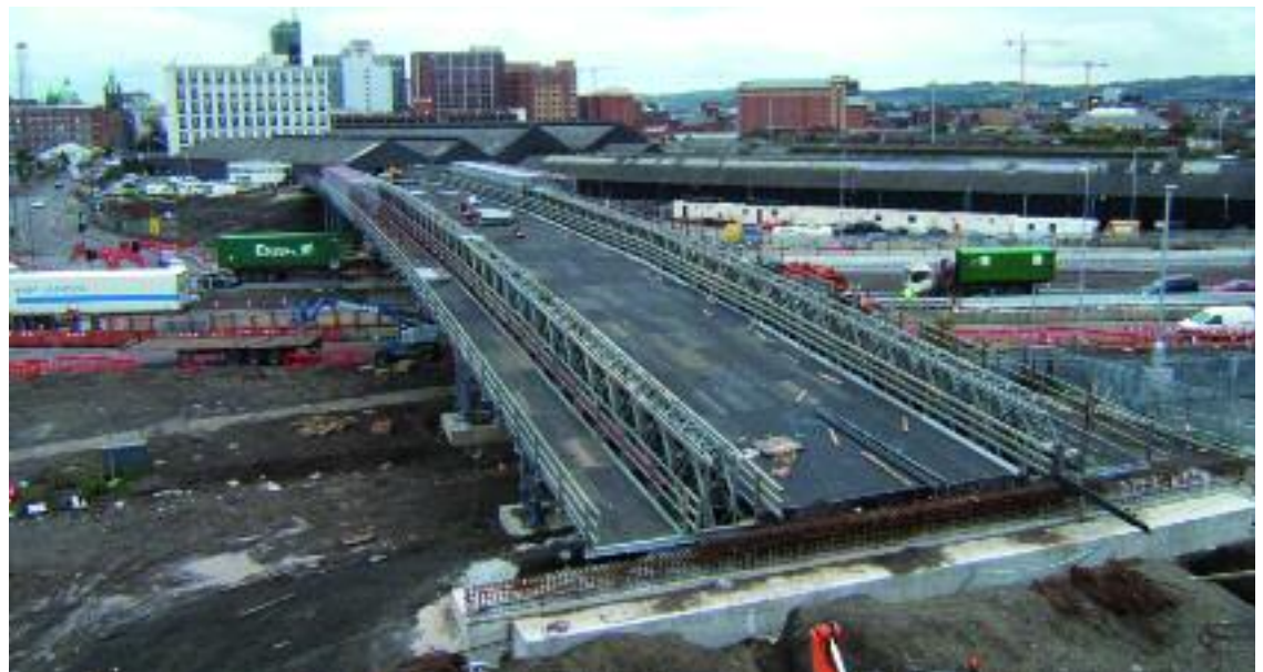
The new temporary Bailey bridge at Grosvenor Road just prior to opening