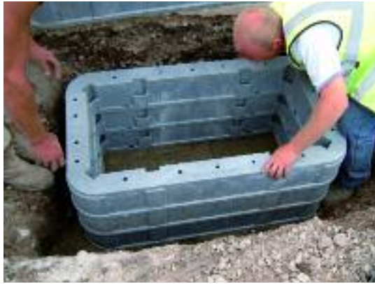
Another Salmor chamber goes into the ground