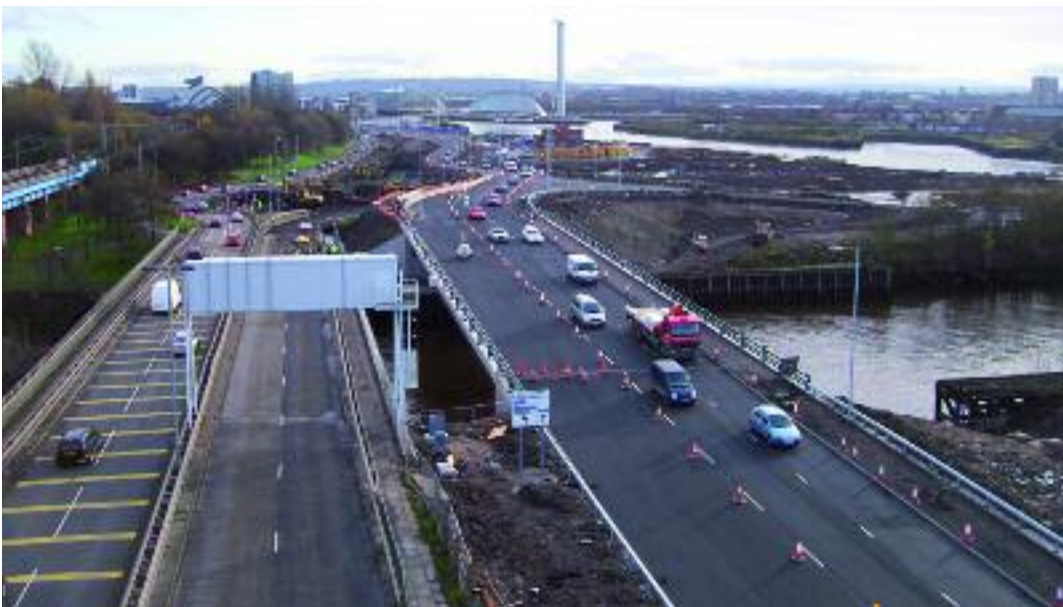
Traffic Management to a Tee – Traffic Flows Smoothly on the Clydeside Expressway

Our correspondent with the Farrans Construction Team in Scotland reports that Phase 2 of the construction works is now underway at Glasgow Harbour Off Site Highways. West bound Clydeside Expressway traffic was successfully switched over onto Stobcross Link Road on Monday 27th November 2006. This allows the team to commence the construction of the south abutments of the Partick Link Bridge and Footbridge and the first span of the Ferry Road Overbridge. Rock socketed piling commenced on the 4th December 2006. In total there are 80 piles of 900mm diameter or bigger to install at 9 locations and 3,000 cubic metres of structural concrete to place with 700 tonnes of reinforcement to tie on the three bridges over the Clydeside Expressway.