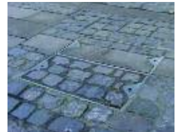
A Salmor recessed cover, Hill Street, Belfast