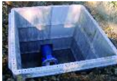
A Salmor valve chamber for Mid Kent Water