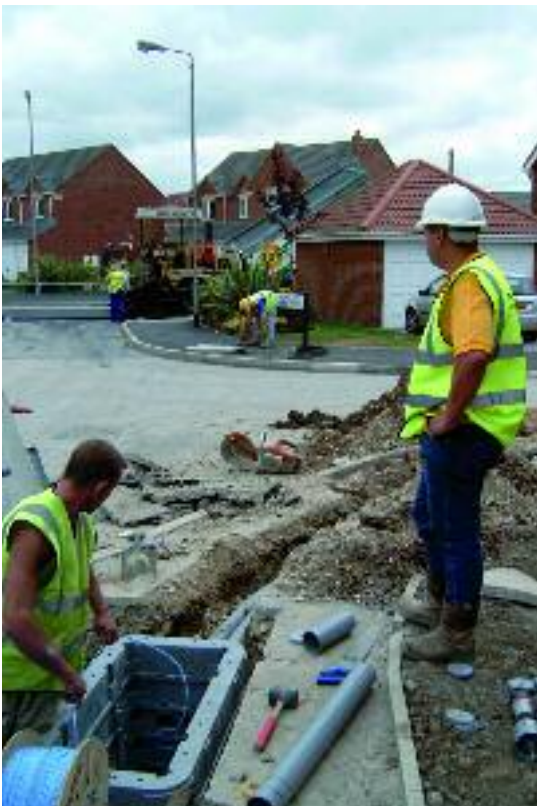
Salmor chambers on a private development site