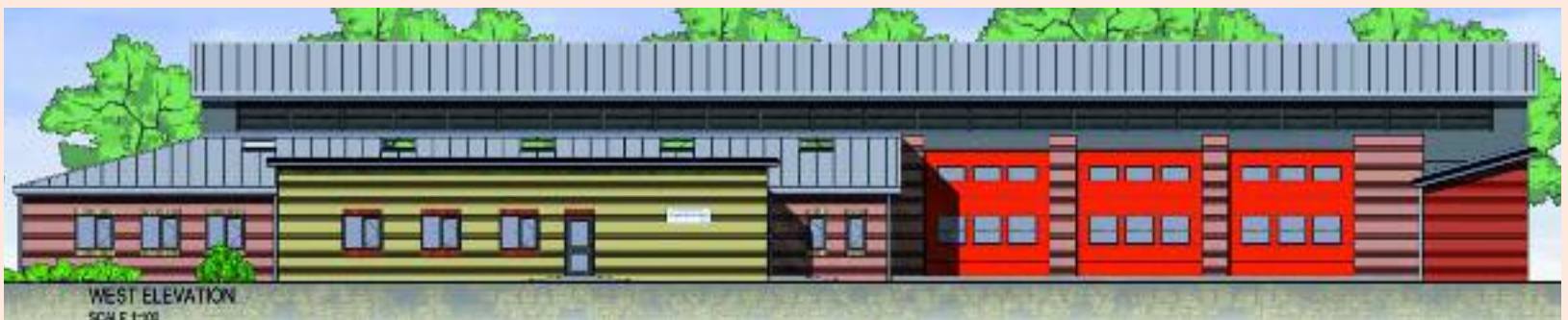
Artist Impression of the soon to be constructed Yarmouth Road Fire Station in Ipswich

The lights on the Christmas tree in the Farrans Cambridge office will be that little bit brighter this year and a few more celebratory glasses will be raised by our people with the news that Construction's English Division have been confirmed preferred bidder on their first Private Finance Initiative (PFI) project.