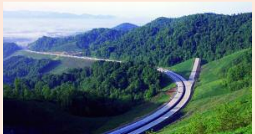
A new section of highway in Georgia constructed by APAC

CRH have also signed a letter of intent to acquire an equity interest in the cement operations of the Jilin Yatai Group. These comprise of 4 integrated cement plants and 1 grinding station, with total cement capacity of approximately 9 million tonnes per annum. The plants are located in the provinces of Jilin and Heilongjiang in Northeast China. The letter of intent provides for the initial purchase by CRH of a 26% equity stake in Yatai Cement with an option to acquire further shares after 3 years up to a maximum of 49%.