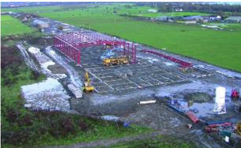
The new tile factory takes shape at Toomebridge

Monday 9th October 2006 was a momentous day for the Northstone Concrete Division because that was the day when the first sod was cut to commence the construction of the new tile plant at the Airfield Site in Toomebridge. This major investment in a state of the art production facility will eventually replace the existing factory at the same location which has served us well for over 30 years.