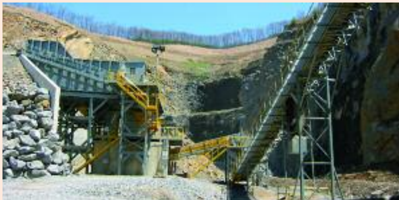
Crushing and Conveying Plant in an APAC quarry in West Virginia

CRH has now reached agreement to acquire the assets of a cement plant in Heilongjiang province in the north east of China. The plant, which will operate as the Harbin Sanliny Cement Company is located in Xiaoling Township, approximately 45km southeast of Heilongjiang's largest city, Harbin (population: 9 million). Harbin Sanliny is a modern plant with two clinker production lines and total cement capacity of 650,000 tonnes per annum.