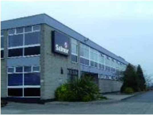
The Salmor Factory in Lurgan