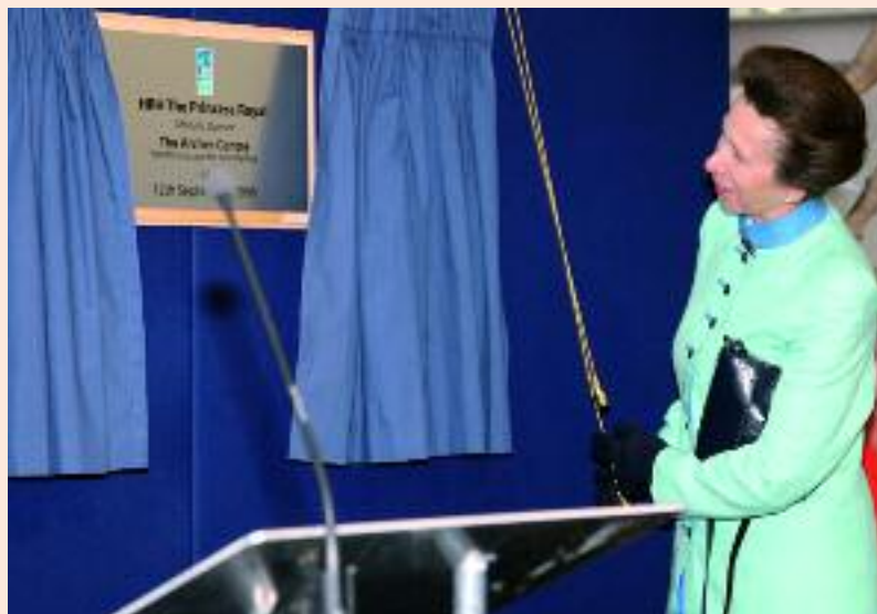
The Princess Royal unveils a commemorative plaque during the opening ceremony at Hollywood Arches

On the hospital side of the business, things have recently taken off at Altnagelvin where the Pharmacy and Laboratory Services Centre, procured under a Private Public Partnership (PPP)/Private Finance Initiative (PFI) arrangement at a value of £14m, is due for completion at the end of January 2007. This just happens to be a full 12 weeks ahead of programme.